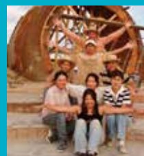
Left: “Entre Corazon Y Mar,” Tijuana, Mexico, 2004