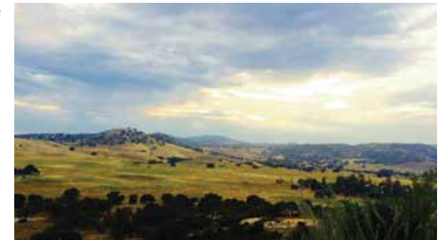
Right: View of the backcountry from upper deck.