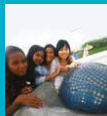
Left: “Salinlahi Park,” Puerto Princesa, Philippines, 2009