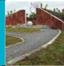
Left: “Soil & Earth Park,” Vladivostok, Russia, 1994