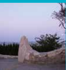
Pacific Rim Park in Yantai, China, 2001