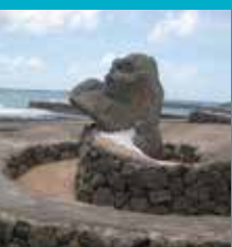
“Stepping Stones of the Pacific Park,” Jeju, Korea, 2010