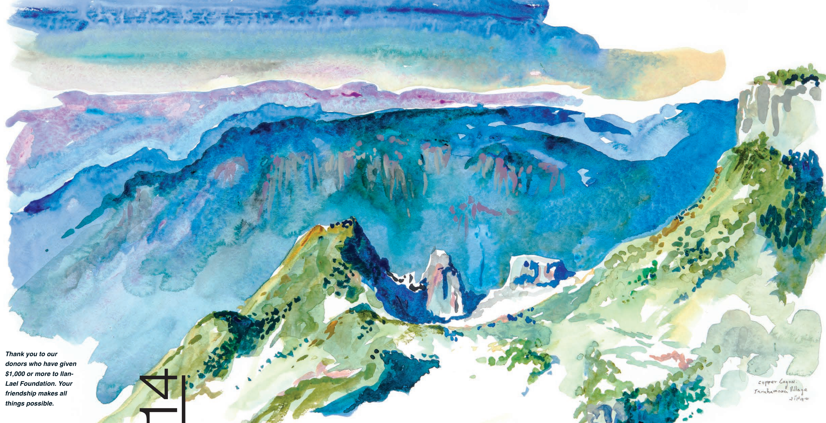
Copper Canyon Tarahumara Village 2014